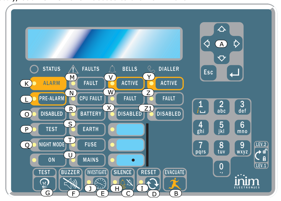
Figure 2 - Front view of the Repeater panel

This control panel supports up to four Repeater panels. Repeater panels replicate all the information provided by the control panel and allow access to all Level 1 and 2 functions (View active events, Reset, Silence, etc.), but DO NOT allow access to the Main menu.