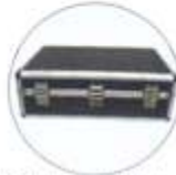
Reinforce construction 3 hinges and corner protector.