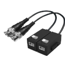
PFM800-E Passive HDCVI Balun