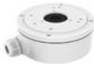
DS-1280ZI-XS Junction Box